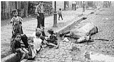
The close of a career in New York

Primary sources are snippets of history. They are incomplete and often come without context. They require students to be analytical, to examine sources thoughtfully and to determine what else they need to know to make inferences from the materials.