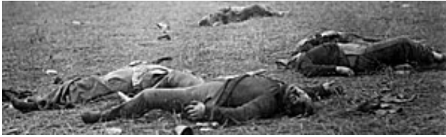
A harvest of death, Gettysburg, July, 1863

In analyzing primary sources, students move from concrete observations and facts to making inferences about the materials. “Point of view” is one of the most important inferences that can be drawn. What is the intent of the speaker, of the photographer, of the musician? How does that color one’s interpretation or understanding of the evidence? A high school teacher states that, “Discovering that two people seeing the same primary source differently creates a kind of dissonance that opens up the meaning of the source and creates new understanding in learners.