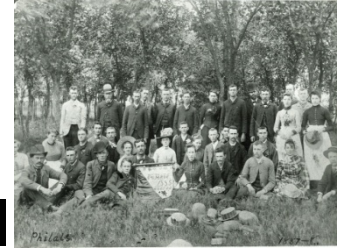
OU Philatathean Society