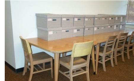
Working with Archives