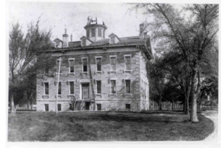
Taui Jones Hall