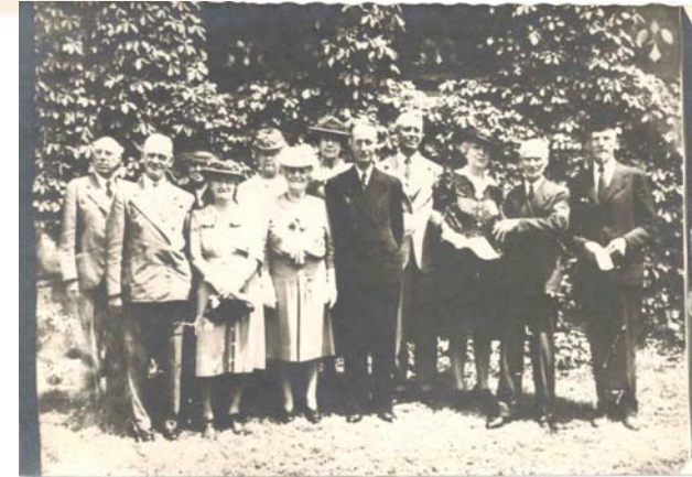
OU Class of 1895

Students are required to work five to ten hours a week and must schedule set hours with their Archives Supervisor. If a student cannot work their scheduled hours, they must discuss alternative work hours with the Archives Supervisor.