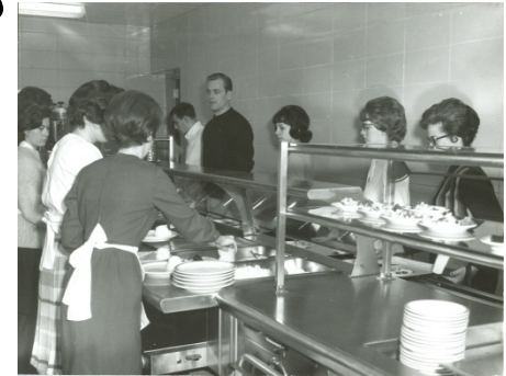
1950's Cafeteria Line