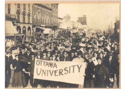
OU Football Rally